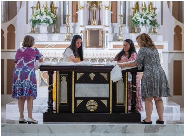
Ladies from the parish wipe the Sacred Chrism off of the Altar mensa.