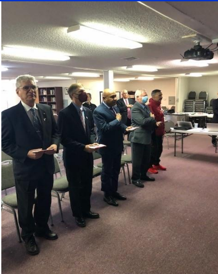
Fourth Degree Exemplification 01/29/2022