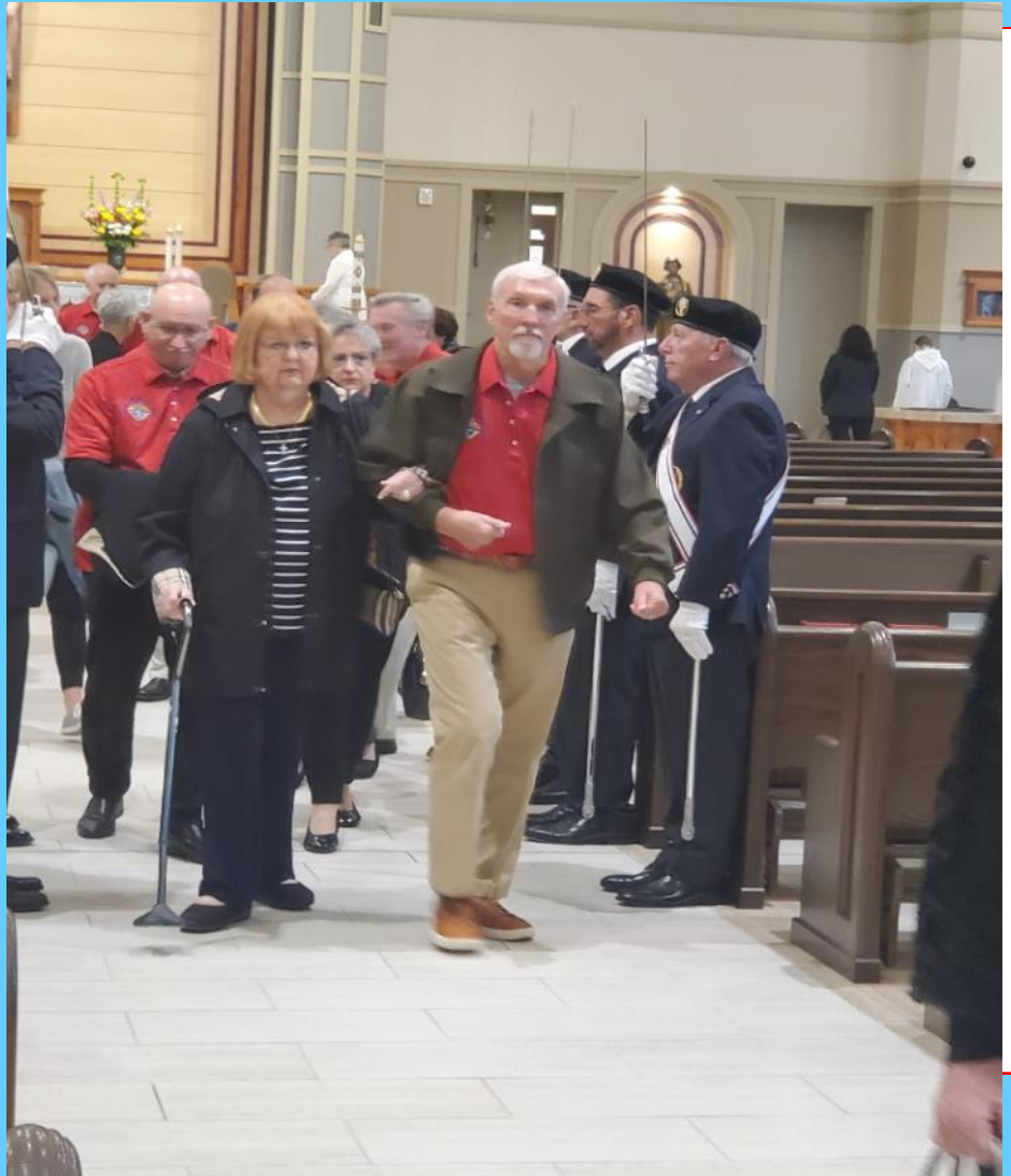
Corporate Mass January 30, 2022