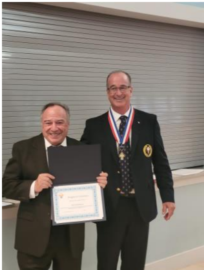
SK Al Connizzo presented with a certificate of appreciation