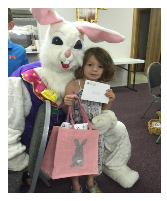
Smallest Golden egg winner.