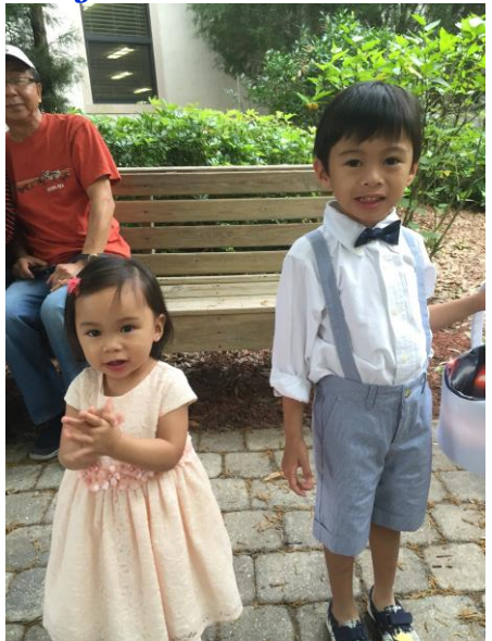
Sister and Brother.