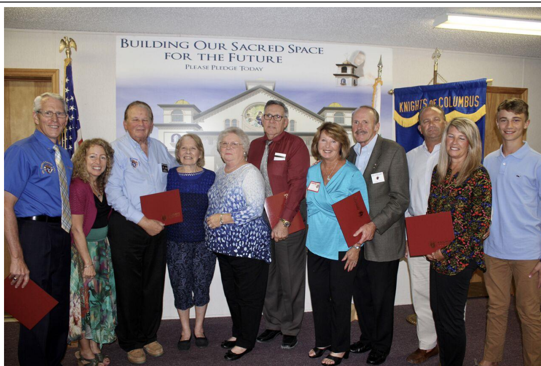
Council Families of the Month.