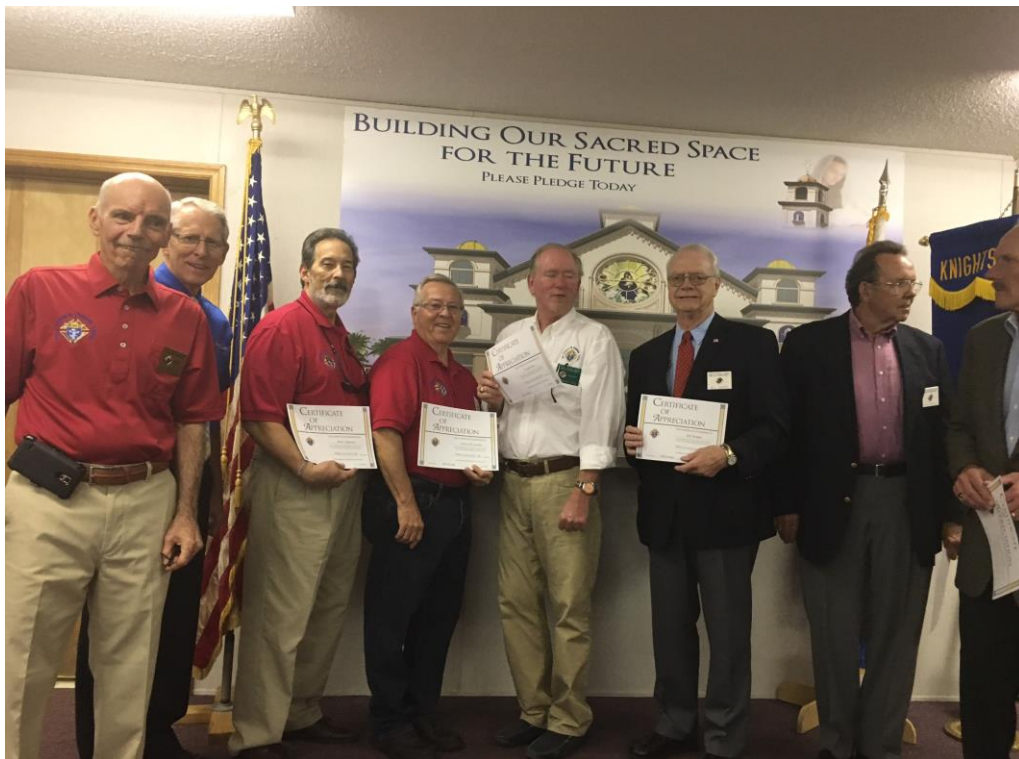
White Cross for Life volunteers.