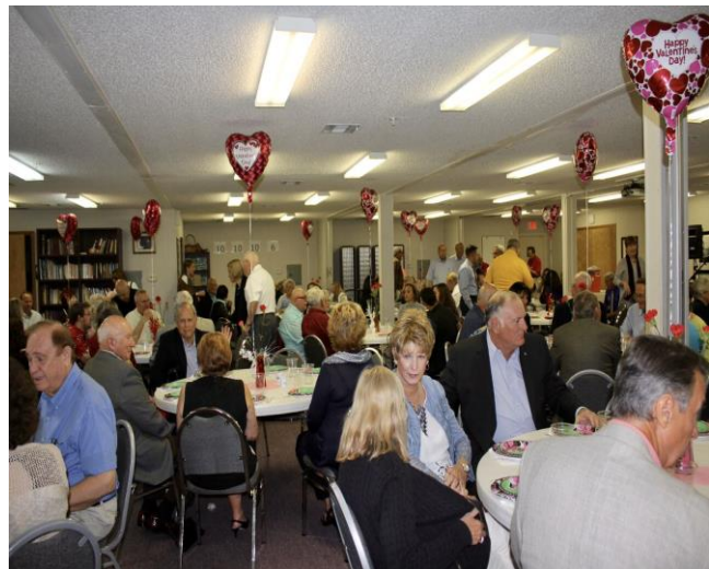
Sacred Heart Hall crowd.