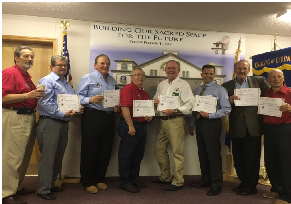
Breakfast with St. Nicholas volunteers.