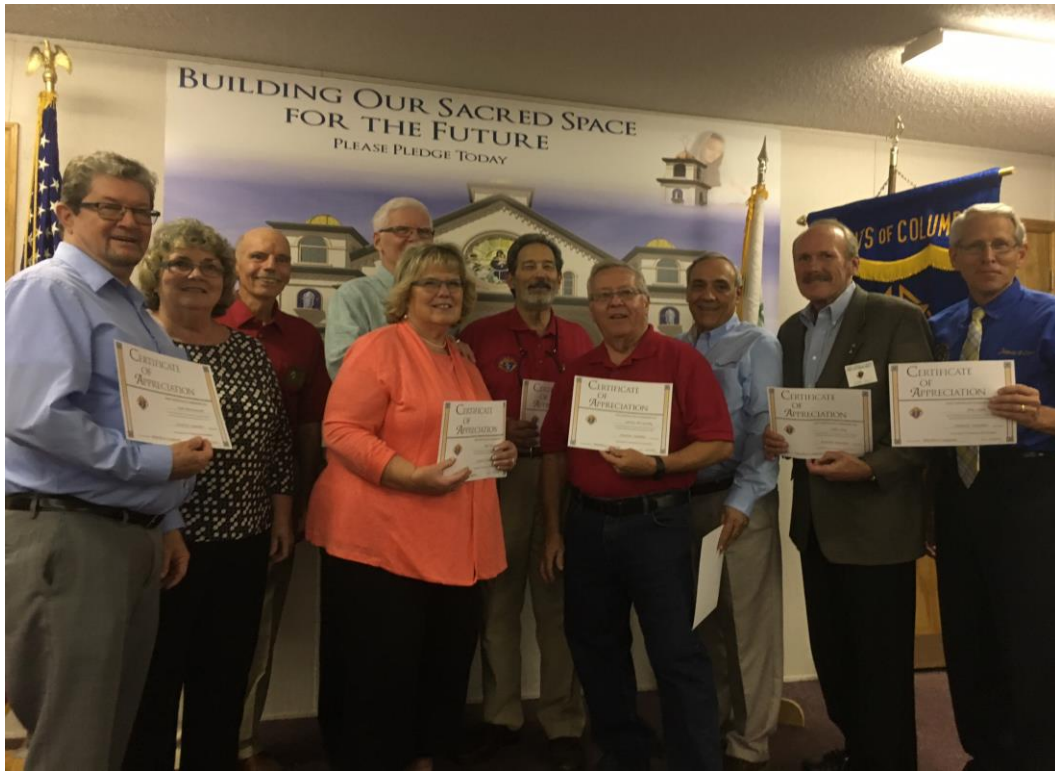
Volunteers recognized for delivering food collected at OLA to 'Food for Families'.