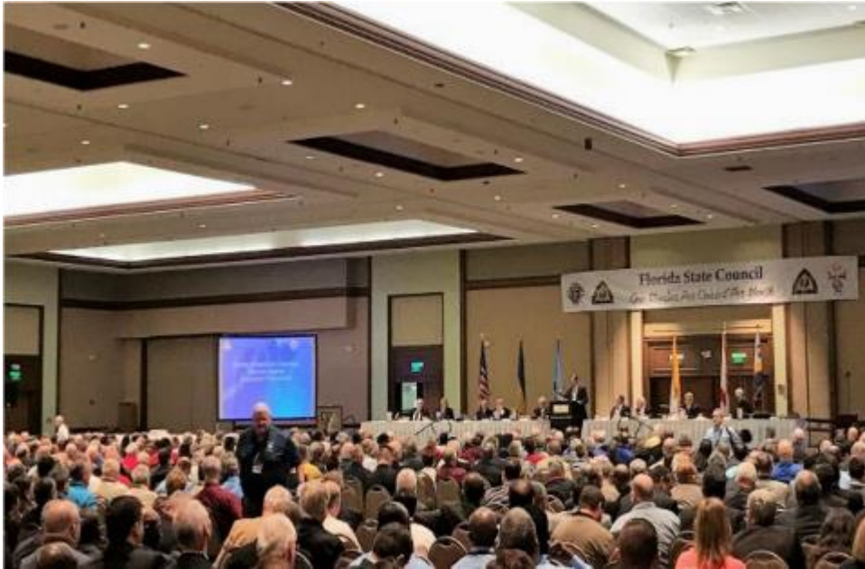
Main meeting room at State Convention.