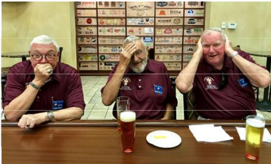
Speak no evil, see no evil, hear no evil.