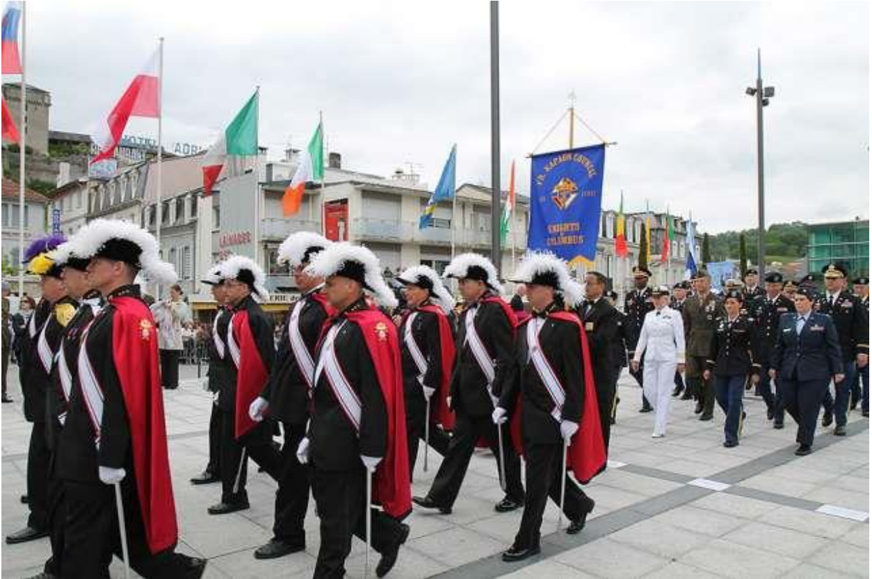
Fourth degree Knights of Columbus in procession at a military ceremony in Lourdes, wearing the uniform in use from 1940-2017.