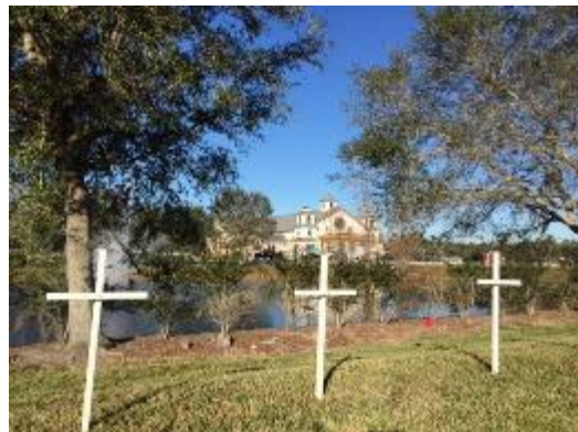
White Crosses placed along White Eagle Boulevard.