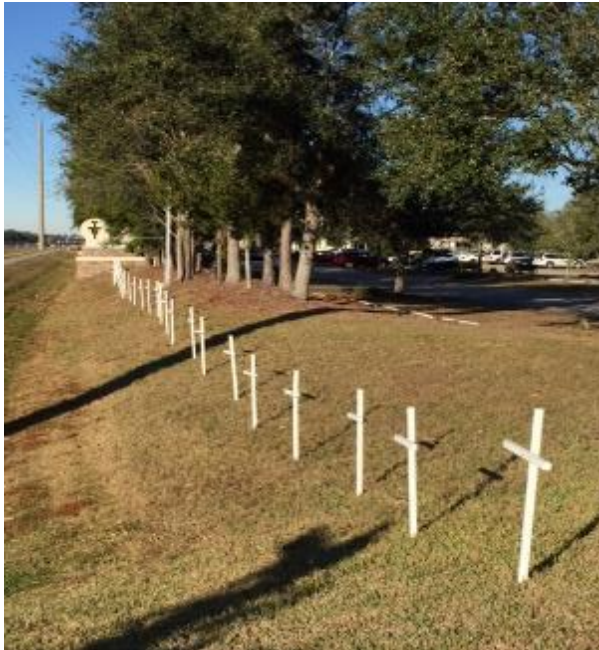
White Crosses placed along State Road 70.