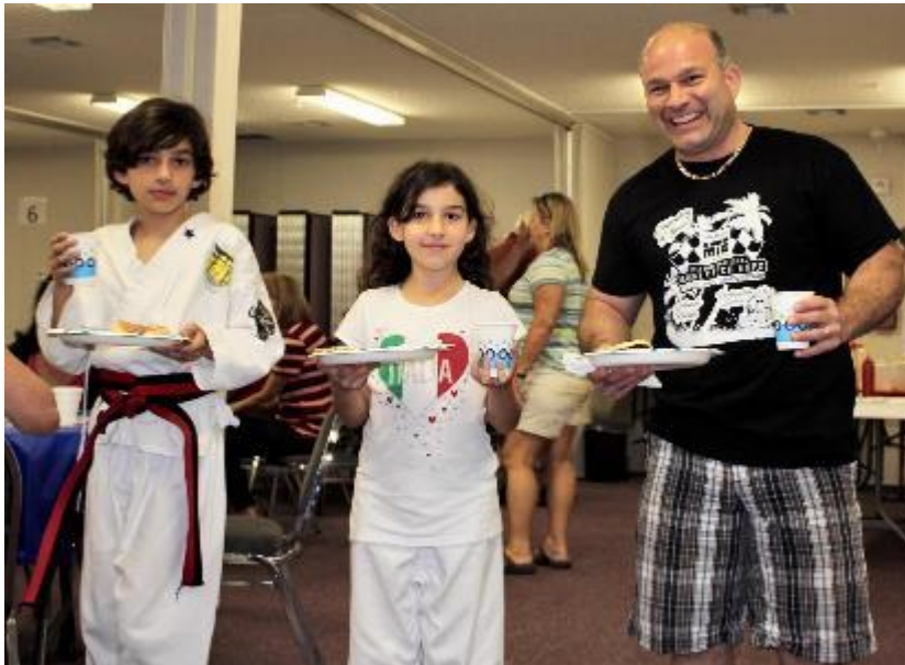
Pancake supper diners.