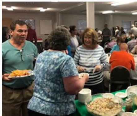
Knights and their wives sharing the work and the fun.

The turnout was fantastic a steady line out the door. Frying fish almost to 7 pm.