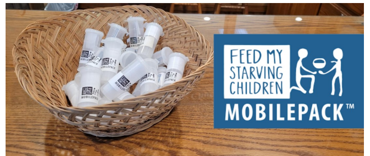
Money tubes can be picked up from the Welcome Center