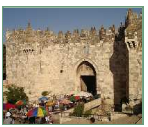
Zion Gate to the Old City of Jerusalem.

The four weeks (June) I spent in Jerusalem were the best part of my sabbatical experience. It was exciting as well as inspiring. I had joined a special study program of the Centre for Biblical Formation in Jerusalem. It was a study of the