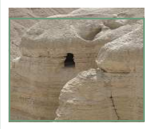
Caves in which Dead Sea Scrolls Found.

Another trip that we took was to the Judean desert and the Negev Desert via the Dead Sea Valley. On the way we stopped at a place called Engedi and got into the Dead Sea for a great floating experience due to the rich salt content. On the northwestern shore of the