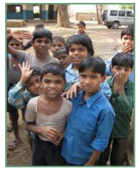
Children from mission hostel.

dren, who live at the mission hostel, put on a program for us. They presented me with a garland of fresh flowers and then the different classes did their native dances in turns. What a wonderful welcome. It is through these kinds of performances that our fathers and the sisters teach the young people to work together and introduce them to the English language.