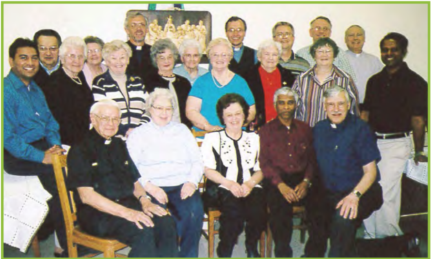
Caritas Christi Members (center) with members of the Pallottine Fathers & Brothers of the Mother of God Province

As we began to grow smaller we asked ourselves what will happen to the UAC in Milwaukee and one day our prayers were answered. We now not only have one UAC group, but two to continue our work to promote St. Vincent's charism and to make a difference in our parish and community. If you would like to know more about the Union of the Catholic Apostolate and St. Vincent Pallotti call me at (414) 258-4117.