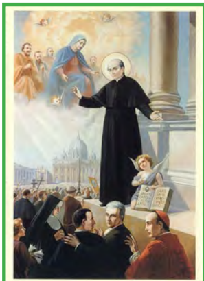
Vincent Pallotti was canonized a saint in 1963 by Pope John XXIII. An artistic portrayal from that event.