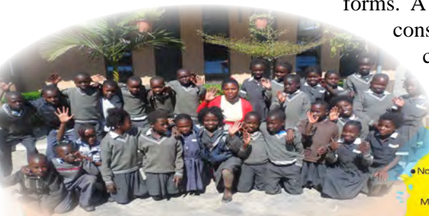
A class of students helped by the Pallottines

The Pallottines near Lusaka, Zambia are helping many orphaned and destitute children to get and continue their education by providing them with school supplies, tuition grants, food and uniforms. A goal for 2014 is to begin the construction of a school for these children in the local area.