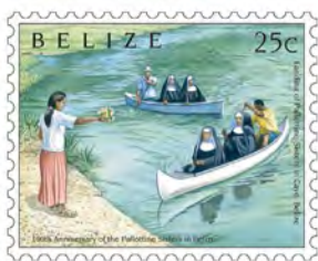
One of the stamps in a series of three commemorative stamps issued to mark the 100th anniversary.

excerpts from an article published by the Belize postal staff Oct. 9, 2013