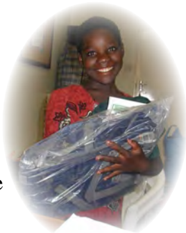
School supplies for a needy student.

The life blood of any nation is the education of its citizens. For a country to prosper and thrive, it must continue to deepen its pool of highly-educated men and women to lead the country, strengthen and expand its work force, care for its sick and elderly and improve the standard of living for all its citizens.