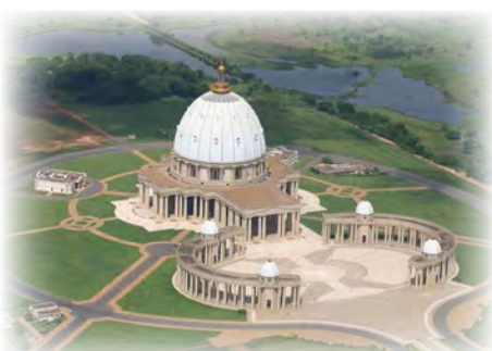
Our Lady of Peace Basilica in Ivory Coast entrusted to the Polish Pallottines in 1991