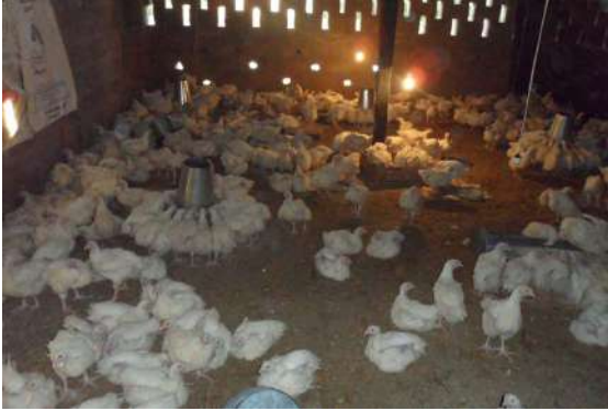
Raising chickens helps provide food for the poor.

It has been said many times before: Give the poor some food and you feed them for a day. Show them how to grow their own food and they will be able to feed themselves.