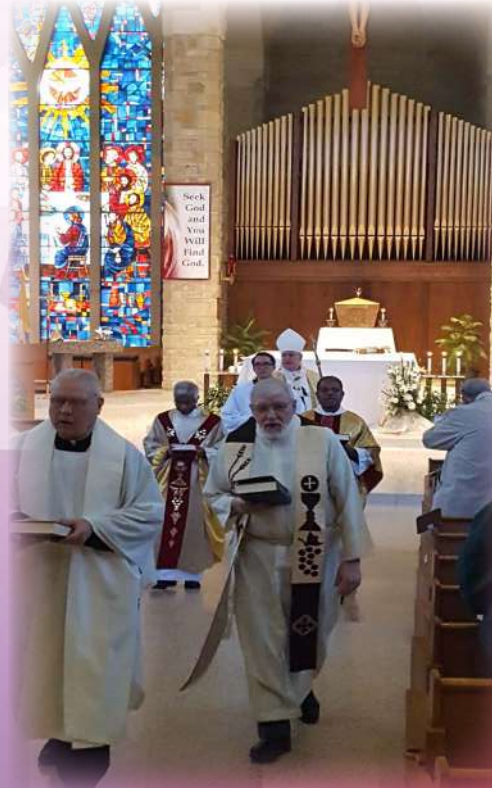
Inside St. Vincent Pallotti Church and Parish Center.

Following the Mass, the celebration continued in the Parish Center with a luncheon, which proved to be to be a great time for good food and wonderful conversation.