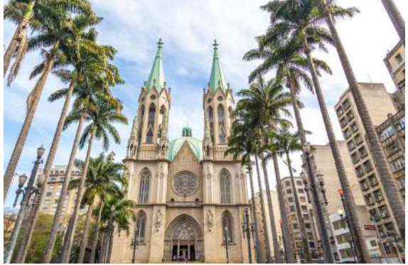
The Cathedral in San Paulo. In Portuguese it is known as the “Catedral Metropolitana de São Paulo”