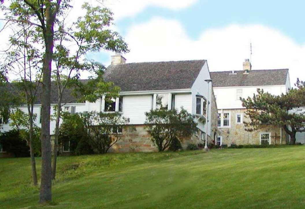
A view of the Center from one of the walking trails.