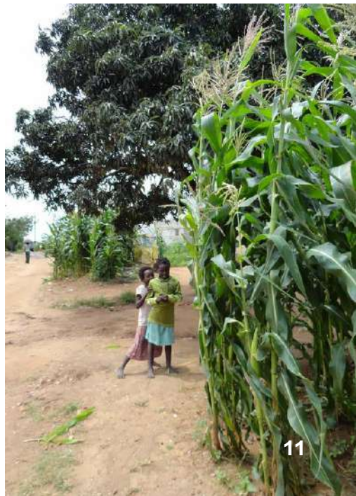
Corn grows tall in Zambia

These farm projects have been working so well that the mission is able to sell any surplus foods at a local marketplace, which, in turn, generates extra income. Indeed, our men are finding creative ways to use wisely the funds they receive, and at the same time to help provide many people with a hopeful future.