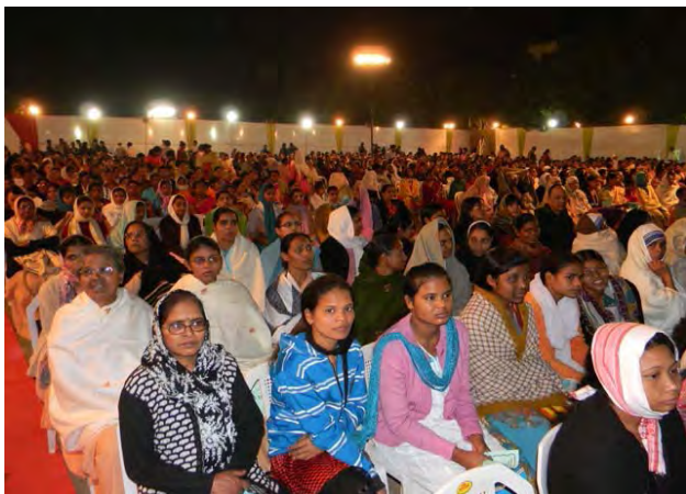
Thousands celebrated the 50th canonization anniversary

Nearly three thousand friends and well-wishers attended the ceremony and festivities.