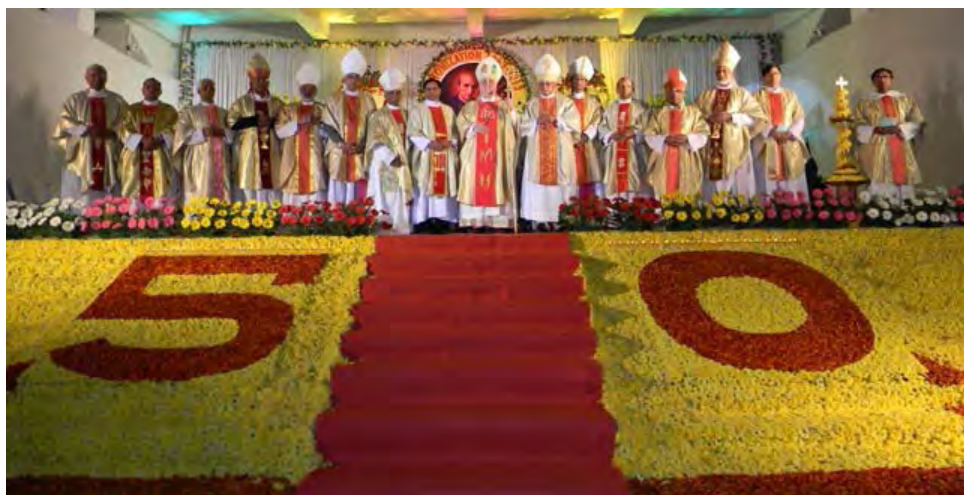
Thousands of red and yellow flowers were painstakingly set in place as part of the elaborate decorations for the Mass and celebration of the 50th anniversary of Pallotti's Canonization.

After the Mass, the day's festivities were marked with a cultural programme that included a play on the life of St. Vincent and various folk dances from the various regions where the Pallottines have their missions.