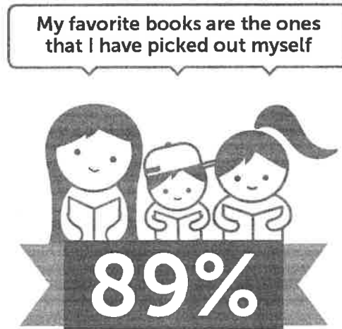
Figure 6. Children's agreement with statement