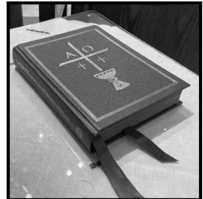
Roman Missal for Collect

The Priest will often say "Let us pray" to indicate for the server when he needs the Roman Missal (red book) held for the Collect. Watch the Priest for a signal to pick up and/or hold the Roman Missal for him.