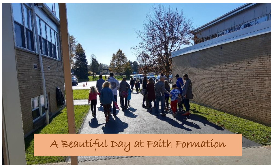
A Beautiful Day at Faith Formation