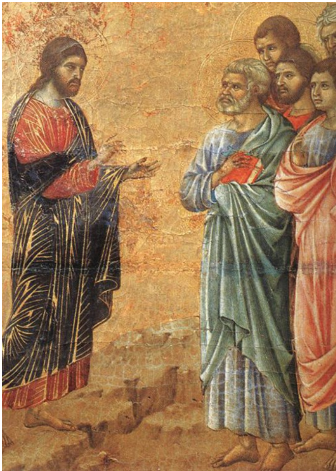
Art: "Appearance on the Mountain in Galilee", Buoninsegna, 1308-11

The Twenty-Third Sunday in Ordinary Time | Sept. 10th, 2023