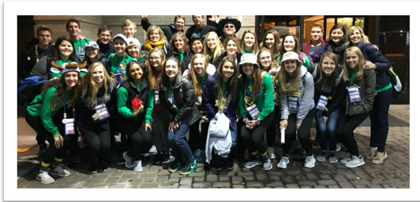
NCYC 2017 in Indianapolis

NCYC is a three-day celebration of Catholic young people which gathers over 20,000 high school teens and adults from across the country to pray, learn, and celebrate our faith. There are nationally recognized speakers, inspiring music, and LOTS of energy! The days are filled with amazing workshops, prayerful and informative hands-on activities, and a chance to bond with