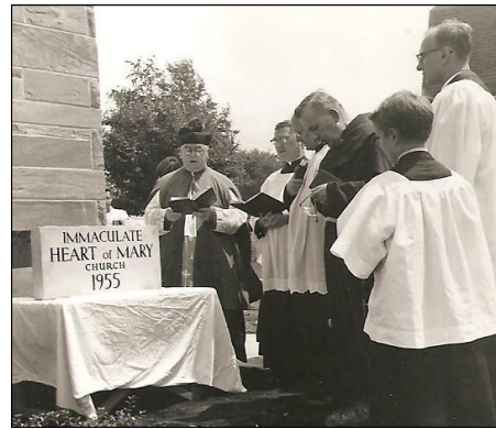
CORNER STONE LAYING

orchard stone trimmed in limestone. Five different Italian marbles were used throughout, verde antique, rosa verona, rosa broccato, red morocco and botticino. Fr. Gallagher stated that the reason for the move from All Saint's was due to the