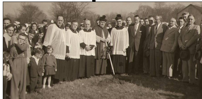
GROUND BREAKING - May 7, 1955

The ground of the new IHM church was blessed and the first spadefuls of earth turned into a ground breaking ceremony. Present during the groundbreaking are shown, left to right: