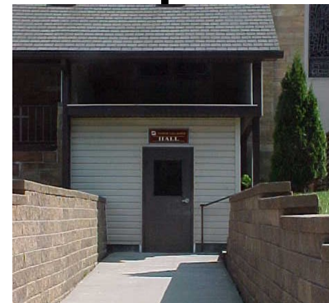
HANDICAPPED ACCESS ADDED