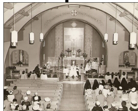
FIRST MASS - October 28, 1956