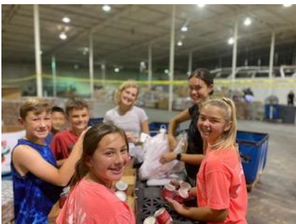
Saint Anne Youth Volunteer at Catholic Charities

We have begun to explore different forms of prayer and to learn about practices that help us to become people with rich prayer lives. We will be practicing praying in a variety of ways and making prayer a personal part of our human experience.