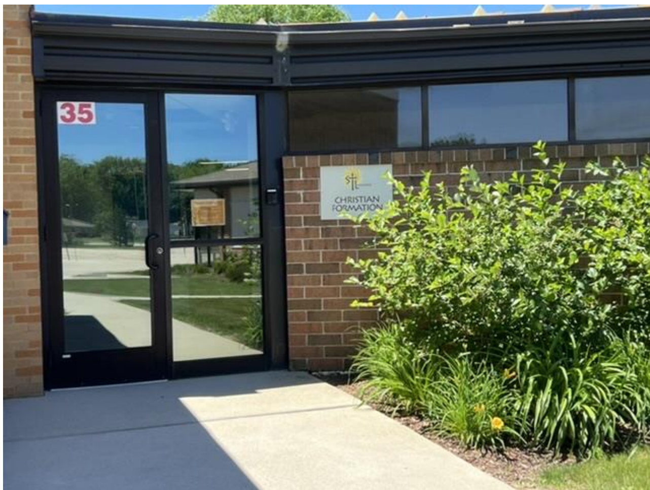
St. Leonard Christian Formation Office Entrance

As always, students are not allowed to leave early for any St. Leonard Athletic event (games, tournaments, or practices).