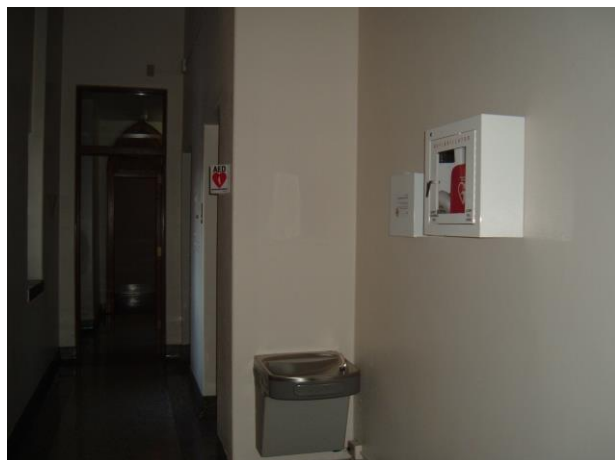
Looking from the school to the church

Answer: St. Mary's AED is located in the hallway leading from the church into the school. It is on the wall above the water fountain. Included in the case with the AED are 2 face masks to use in rescue breathing. Located next to the AED is a fully equipped first aid kit.