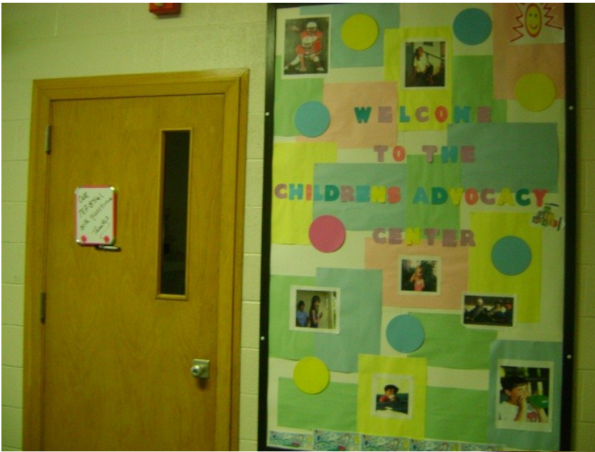
Red River Children's Advocacy Center