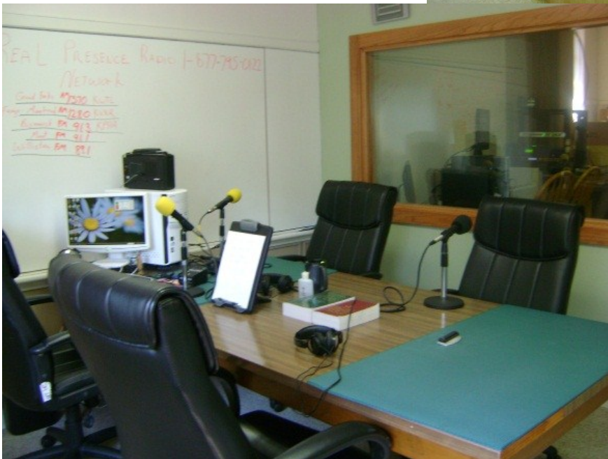
KWTL Real Presence Live Radio Station