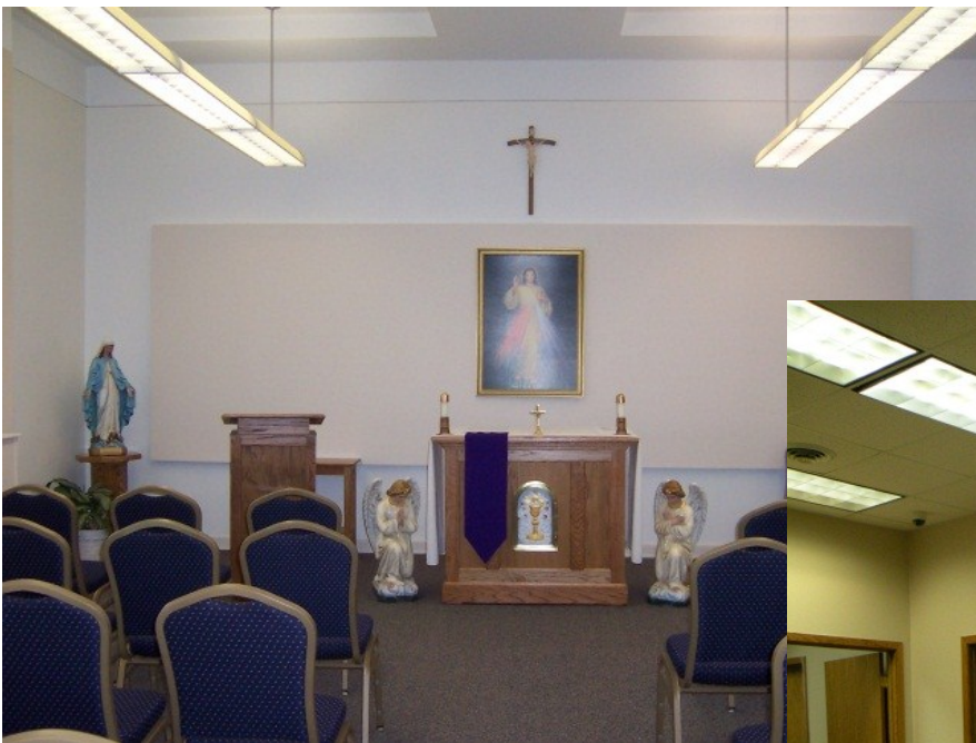
Choir Room and Chapel

Today the building is still being utilized for noble purposes just as it once was. The basement currently houses Project Kids, a daycare servicing toddler to pre-school children. Several of the old classrooms have been remodeled to accommodate the parish office, a chapel/choir room, KWTL Real Presence Live Radio, and the Red River Child Advocacy Center.