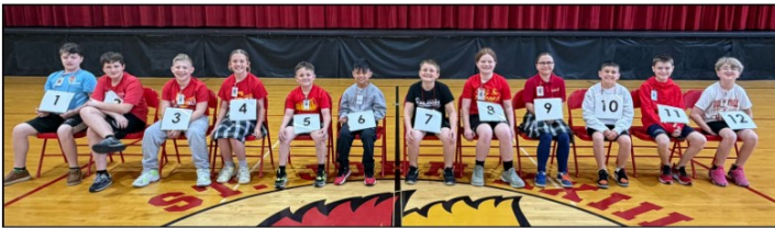
Participants in the 3-5 Religion Bee

..... Congratulations to the participants and winners of our annual Religion Bees! Students in grades three through five and six through eight earned their spots by excelling on a pre-test of Catholic faith knowledge. During the competition, contestants were challenged across multiple rounds such as liturgical seasons, the sacraments, scripture, and the rosary.