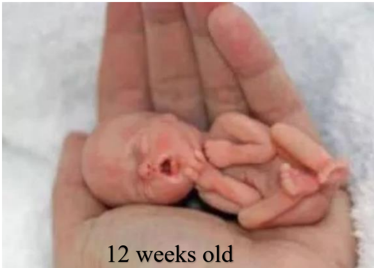
12 weeks old