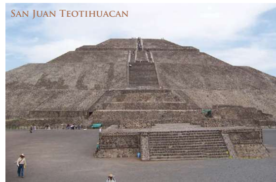
SAN JUAN TEOTIHUACAN

San Juan Diego was baptized, and the Church of Our Lady's apparition to his uncle, Juan Bernardino. We see the ancient ruins of the Aztec pyramid , the colonial cathedral and the modern skyscraper, which graphically represent the Aztec, European and modern influences that have shaped the city. This afternoon we continue to San Juan Teotihuacan and the famous pre-Aztec city that contains the Pyramids of the Sun and Moon and the Temple of Quetzalcoatl . It is for these pyramids that Mexico is called "the Egypt of the New World". From there we have an introductory tour at the Basilica and Shrine of Our Lady of Guadalupe in preparation for our extended visit on Monday. We celebrate Mass at the Basilica (subject to confirmation) before returning to our hotel for dinner and overnight. [B,D]