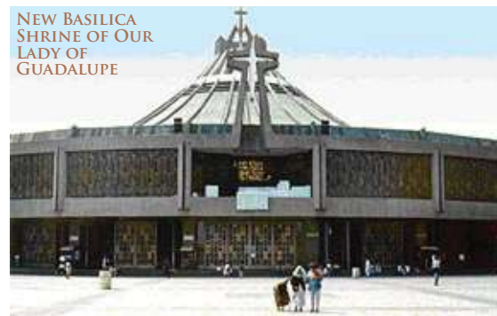
NEW BASILICA SHRINE OF OUR LADY OF GUADALUPE