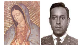
OUR LADY OF GUADALUPE