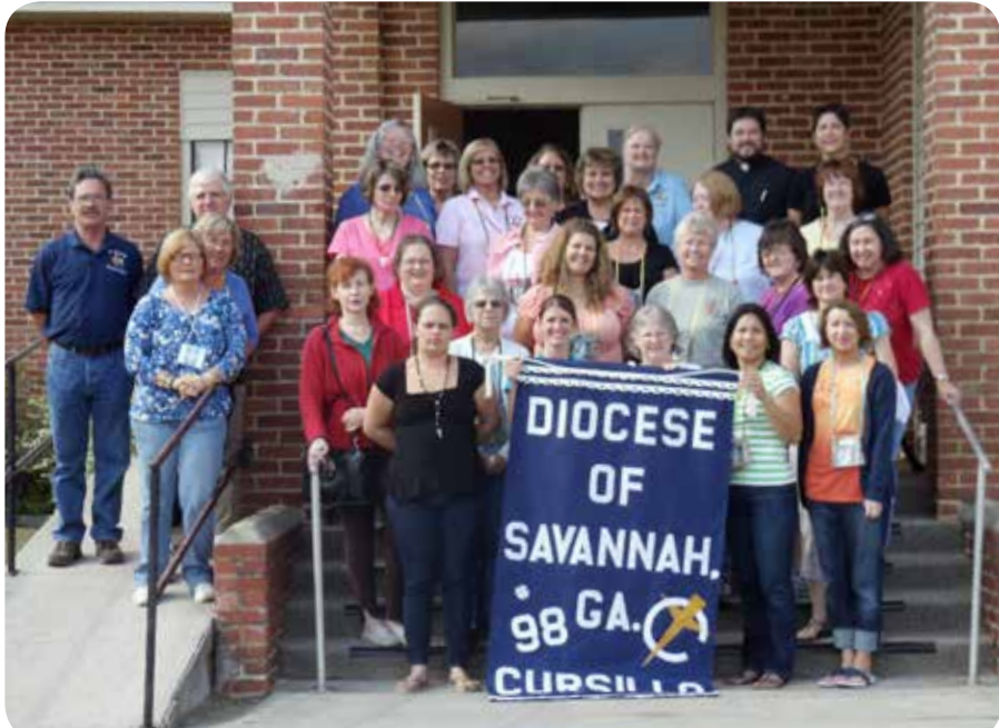
Women’s and men’s Cursillo weekends are held separately.