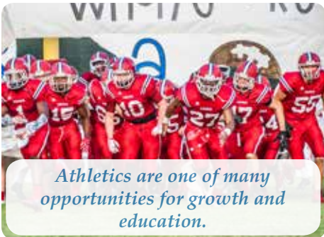
Athletics are one of many opportunities for growth and education.

We are privileged and blessed here in Columbus to have an excellent Catholic school, St. Anne-Pacelli. It is the only private, Catholic preschool-through-12th grade college preparatory school serving in the entire southwestern portion of Georgia. The school is named for St. Anne, the mother of Mary, and Pope Pius XII, whose name was Eugenio Pacelli. It is the Catholic school for our Holy Family young people.