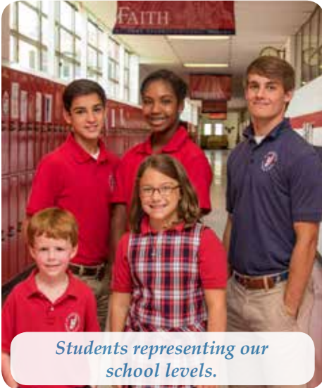
Students representing our school levels.