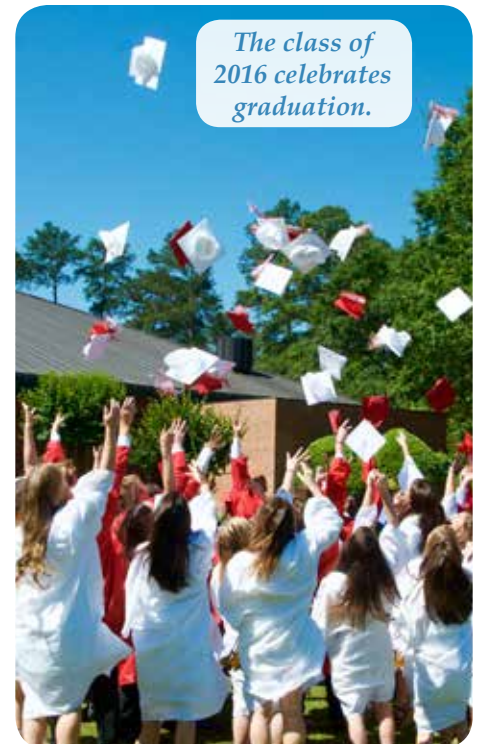
The class of 2016 celebrates graduation.

If you would like more information, please contact the school at 706-561-8232.