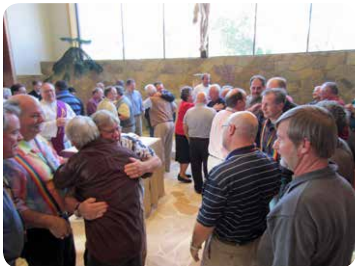
The Holy Spirit moves among those taking part in a Cursillo weekend with intensely emotional moments.