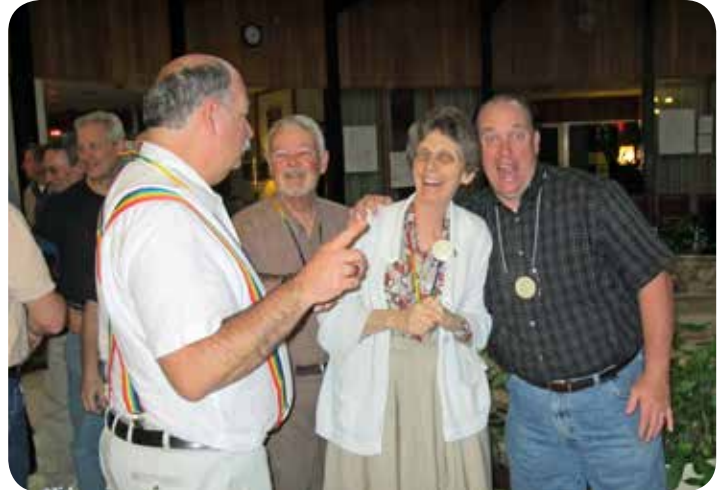
During a Cursillo weekend, there is time for growing in faith and fellowship – and some fun!