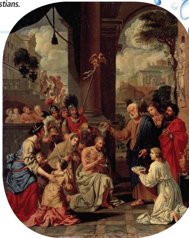
The Baptism of St. Cornelius the Centurion