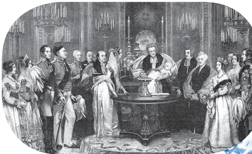
The christening of the Princess Royal

By virtue of your own Baptism, you are a little "christ," anointed with the same Holy Spirit in whom Jesus accomplished his mission. What your child needs from you is for you to let the Holy Spirit do his work that you may faithfully live out your part of the mission of Christ as Priest, Prophet, and King. It is simple, though not easy. What can you start doing now to live your baptismal mission more faithfully? What can you begin doing as a family now and in the years to come to teach your child about his or her priestly, prophetic, and kingly calling?