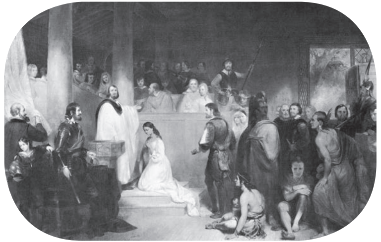
The Baptism of Pocahontas at Jamestown, Virginia, 1613

Heavenly Father, in Baptism you have anointed us with the Holy Spirit to participate in Jesus' mission as Priest, Prophet, and King. Grant us the strength and courage to strive to be ever more fully conformed to Christ and his mission, that we may better guide and guard the children you have entrusted to our care and teaching. We ask this in the name of your Son, our Lord Jesus Christ. Amen.