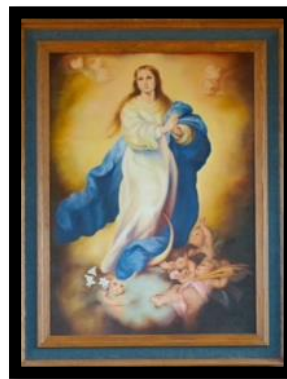
Assumption of Mary