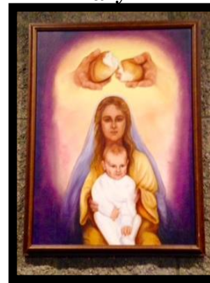
Mary, Mother of the Eucharist