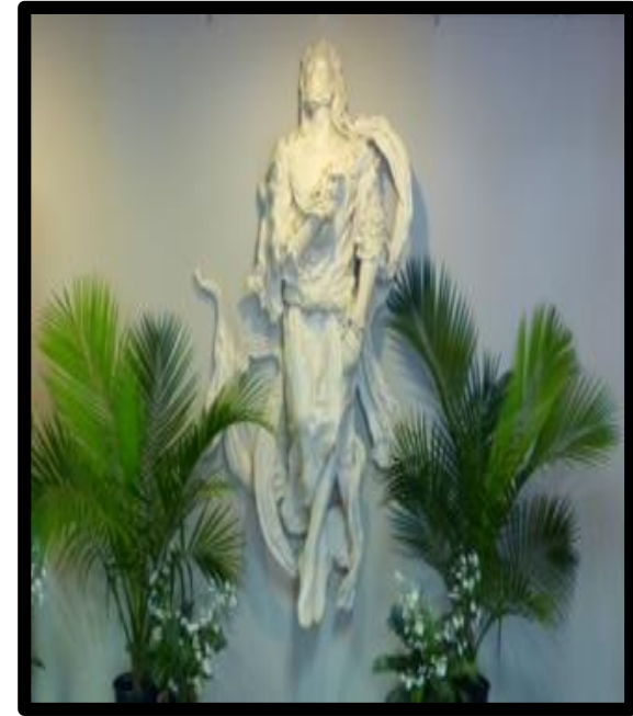
The Resurrection Mary and Infant Jesus