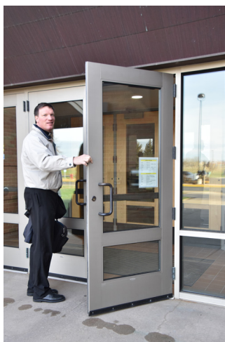
Three sets of steel entrance doors have been replaced, thanks to our parishioners.

The success of the Building Maintenance Fund, through your generosity, allowed the first two goals to be completed. You, the parishioners, took an active