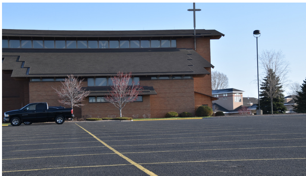
The parking lot was repaired, last October, and new lighting installed in March.