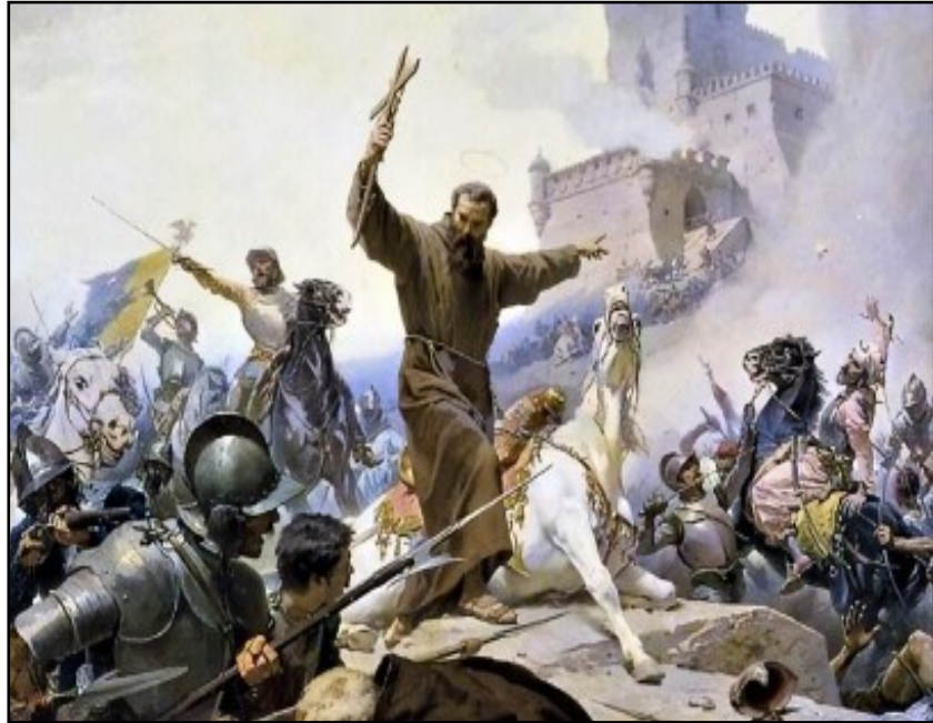
St. Lawrence of Brindisi, Priest and Doctor of the Church—Feast Day July 21