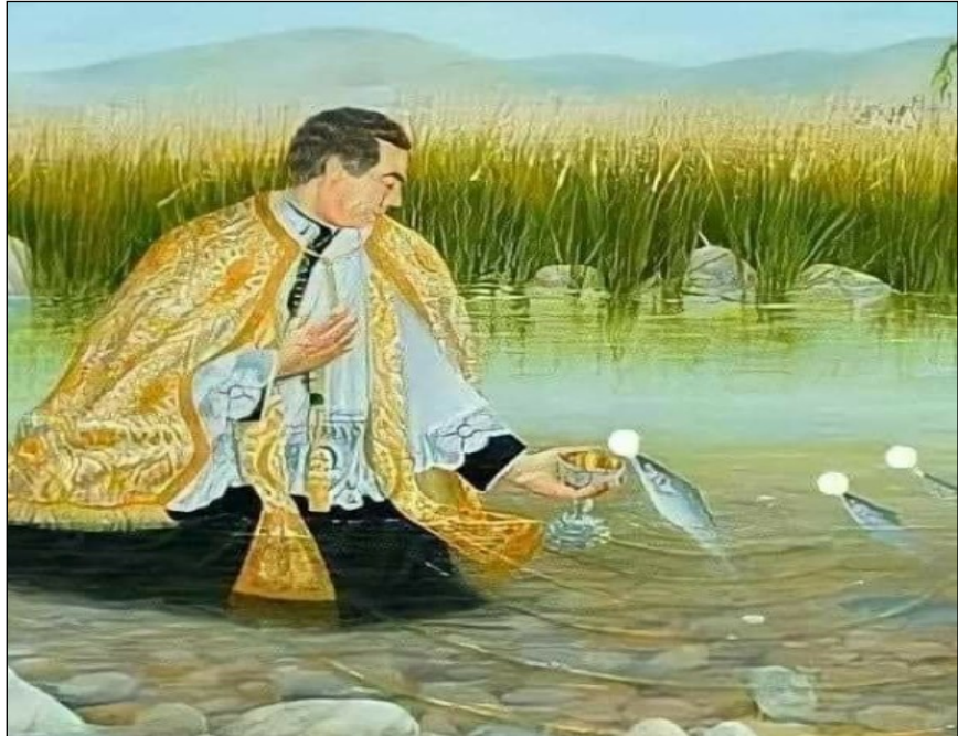
Eucharistic Miracle of Alboraya in Valencia, Spain

Monday 8:00 am—11:30 am Tues. - Fri, 8:00 am –4:30 pm