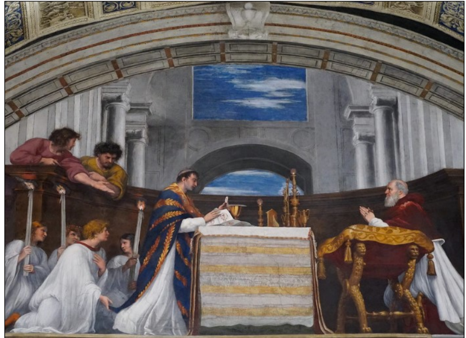
Eucharistic Miracle of Bolsena, Italy in 1263

Monday 8:00 am—11:30 am Tues. - Fri, 8:00 am –4:30 pm