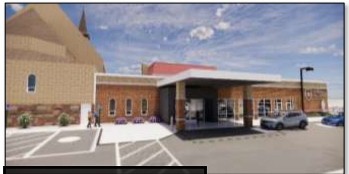
Proposed Main Entry View