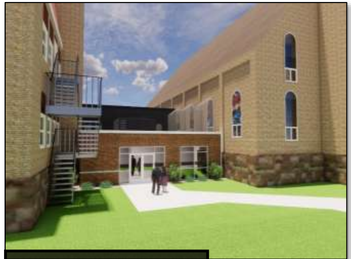
Proposed North Entrance