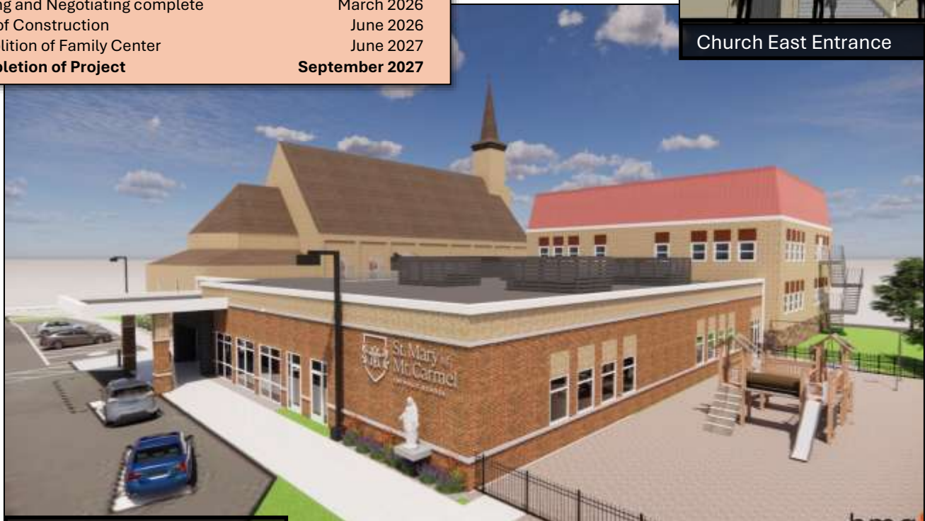
Proposed Aerial View