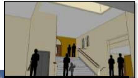
Church East Entrance