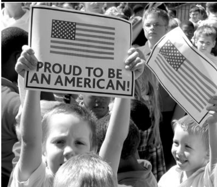
ST. STAN'S CHILDREN REMEMBER SEPT 11!