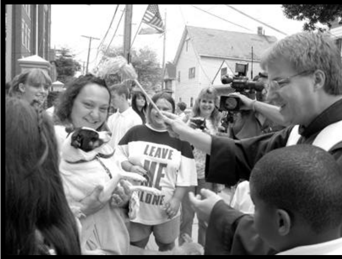
Blessing of the Animals in honor of St. Francis of Assisi, Oct. 3