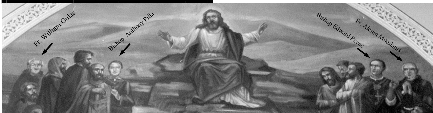
Sermon on the Mount Mural — St. Stanislaus Church West Transept above the doors