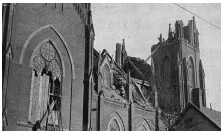
ST. STANISLAUS CATHOLIC CHURCH, CLEVELAND, OHIO. WINDSTORM, APRIL 21, 1909.