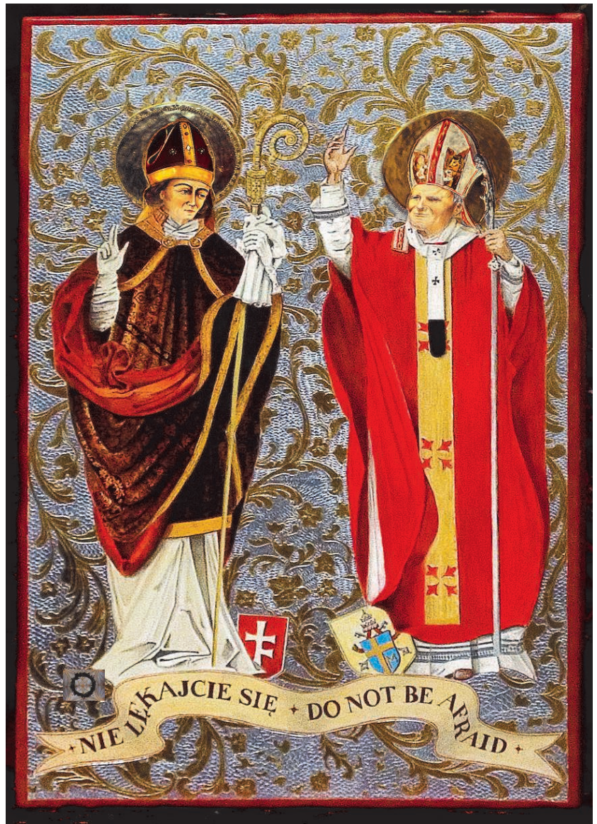
Icon of Saint Stanislaus and Saint John Paul II