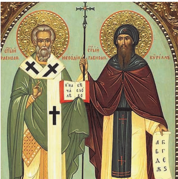
Saints Cyril and Methodius