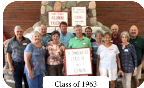
Class of 1963