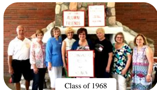
Class of 1968