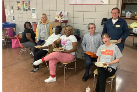
Volunteers breaking for lunch at Pork Chop dinner set-up