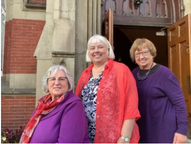
Popular at City Music Concerts 'Church Ladies' Bake Sale