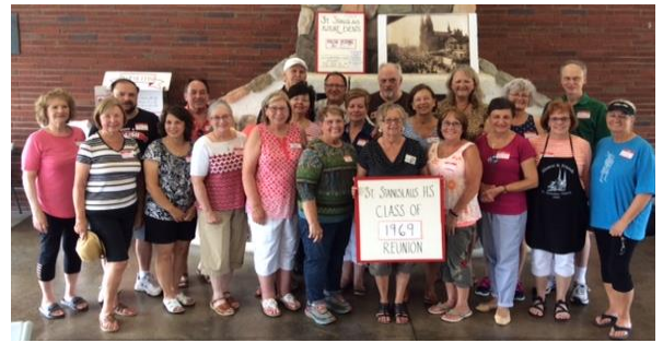
Class of 1969