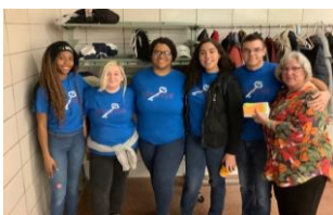
CCC Key Club