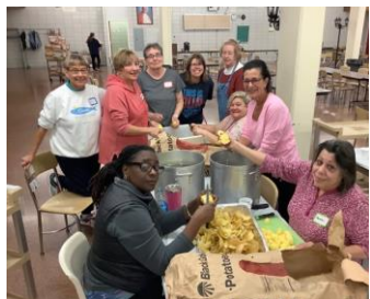
Peelers prepping 75# of potatoes for mashing!

Many thanks to everyone who supported this effort of the Alumni & Friends. We couldn't have done it without all of you.. (Looking forward to seeing you next time...Ingrid)