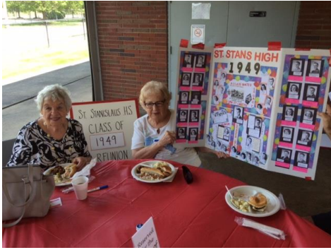
Class of 1949