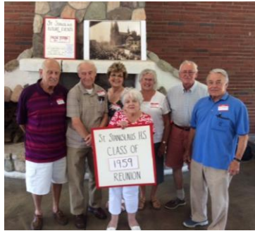
Class of 1959