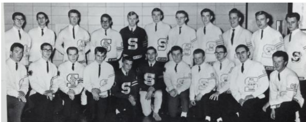
1965 Senior Lettermen