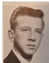
2019 Chase Family