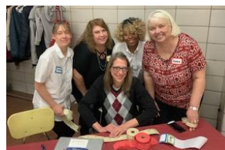
Basket Raffle Sales Team