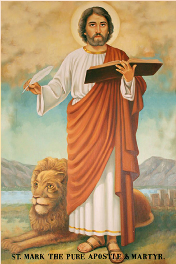
ST. MARK THE PURE APOSTLE & MARTYR.

“A humble man who lives a spiritual life, when he reads the Holy Scriptures, while relate all things to himself and not to others.!”