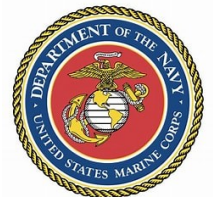
Marine Corps (F)