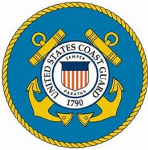
Coast Guard (B)