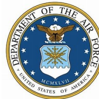
Air Force (E)