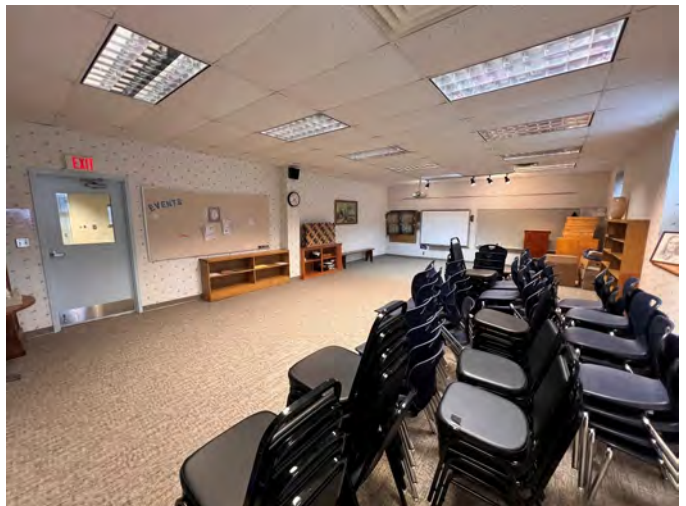
New carpeting in the CLC-Meeting Room.