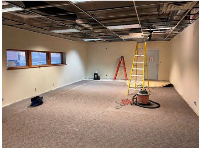
CLC-Bathroom and Assembly Room: Flooring and plumbing fixtures installed in the Bathroom. Utilities are in. New drywall in Assembly Room. Painting in process.