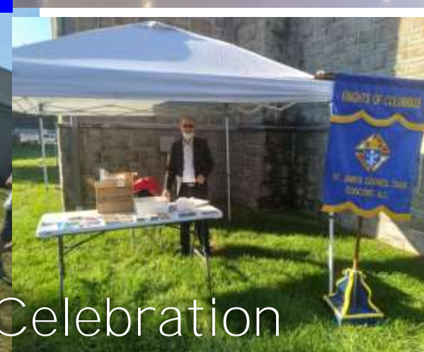
Parish Regather Celebration