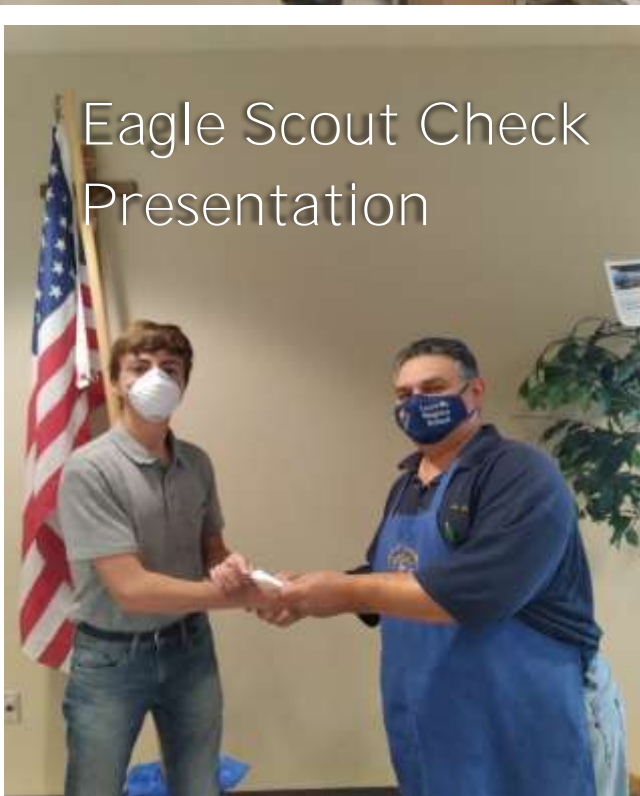
Eagle Scout Check Presentation