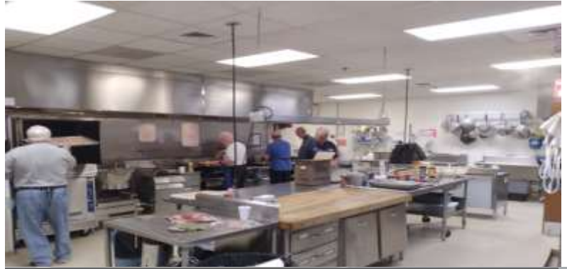
Council March Breakfast