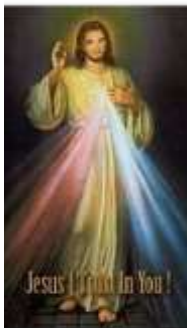
DEVOTIONAL IMAGE BY ENLERT

This article appeared in the May 2011 issue of U.S. Catholic (Vol. 76, No. 5, page 46).