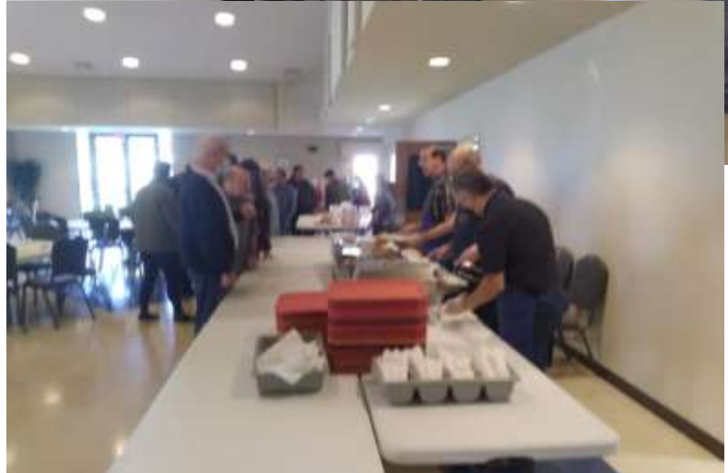
Council March Exemplification